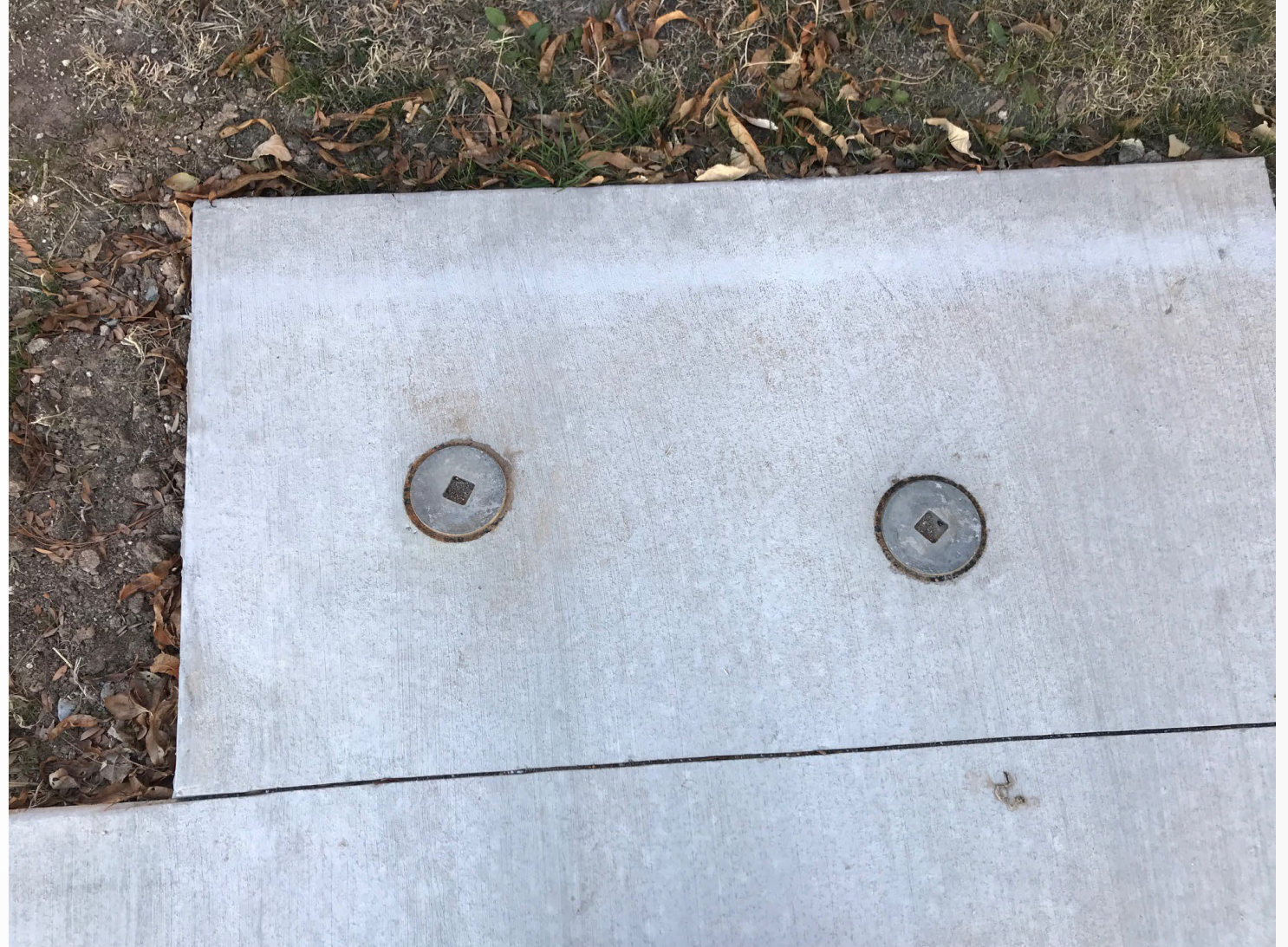
Exhibit H Matching Funds Resolution