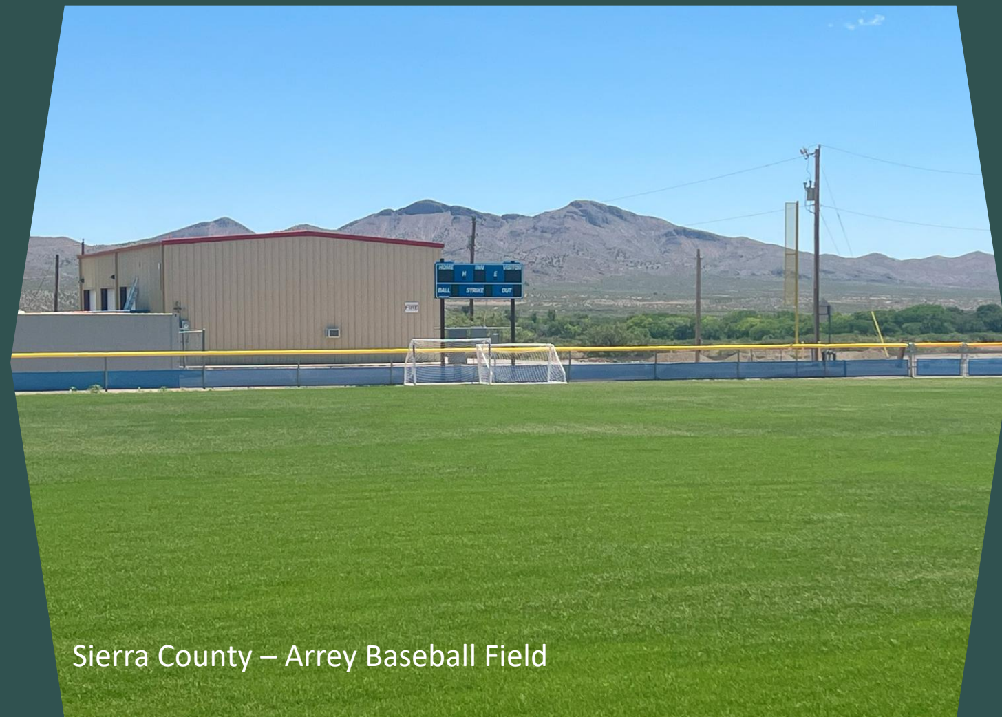
Sierra County – Arrey Baseball Field