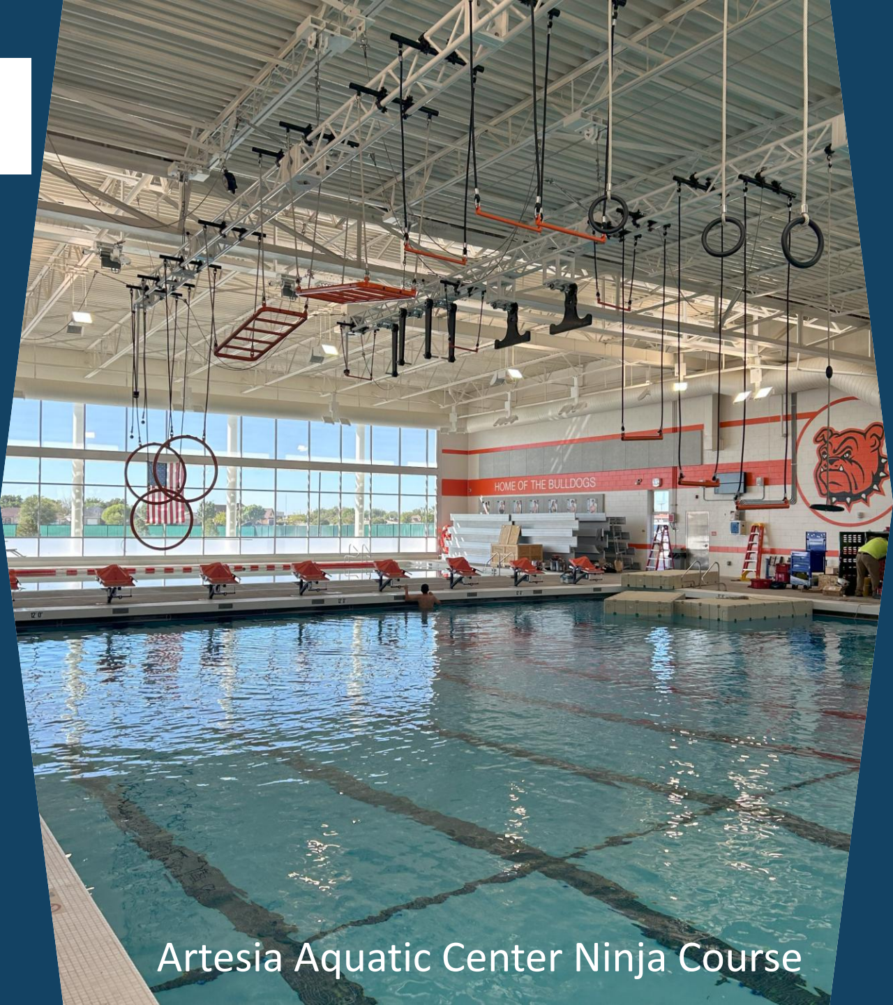
Artesia Aquatic Center Ninja Course