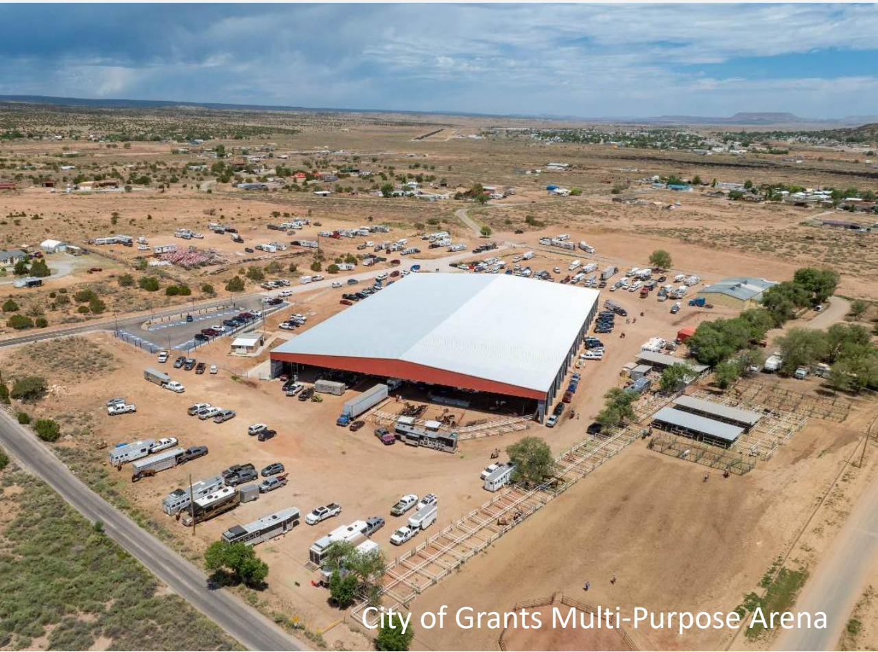
City of Grants Multi-Purpose Arena